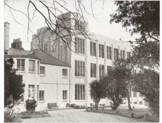
BLANCHELANDE COLLEGE, GUERNSEY.